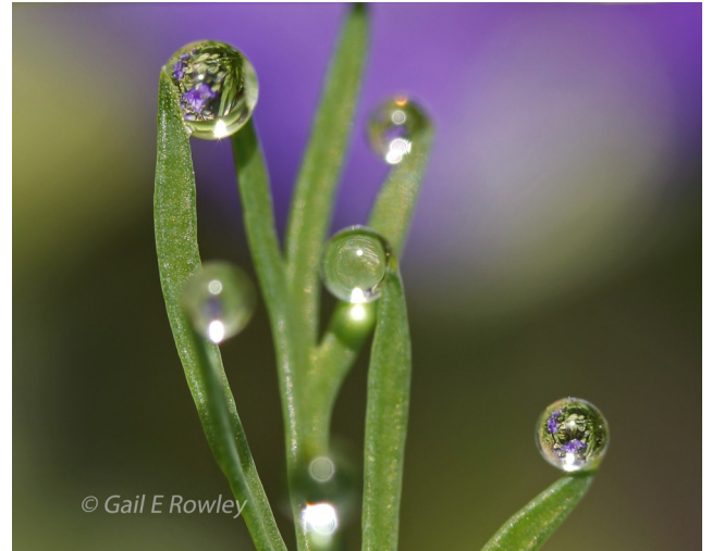
Purple and Green